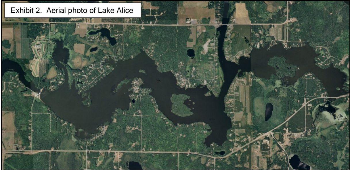
Exhibit 2. Aerial photo of Lake Alice

Reportedly, Lake Alice is host to the non-native, invasive purple loosestrife and curly leafed pondweed. It is also reported to harbor the Chinese mystery snail and the potentially destructive rusty crayfish. As far as we understand, Eurasian water milfoil has not been found in Lake Alice. All of these invasive, non-native species need to be part of an adaptive management plan for Lake Alice. Future phases of the plan will focus on aquatic invasive species. Identifying where they exist and mapping their distribution will be a priority for Lake Alice planning and management.